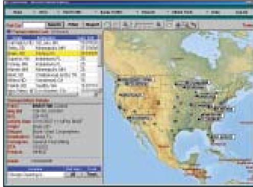
Web page of CompuWeigh's Enterprise Logistics System railcar tracking system.